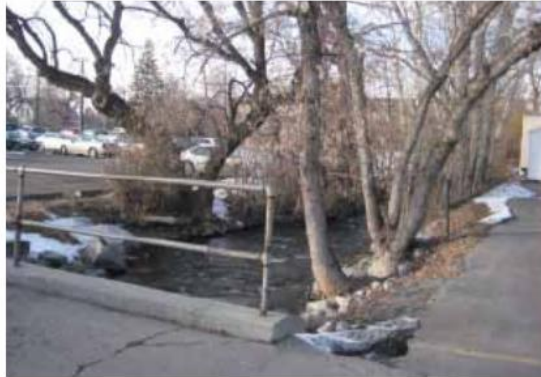
Current creek condition

Preliminary Next Steps (p.44) calls out for a “Greening Downtown” Plan to “better identify opportunity to green the alleys, establish pocket parks, and enhance Bozeman Creek.”