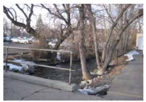
Current creek condition

Bozeman Creek should be revealed and made a centerpiece of downtown's open space system. Where the creek cannot be exposed, it should be highlighted with public art or surface treatments. When space is available, public open space and seating should be provided.